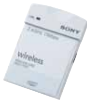
SNCA-CFW1 Wireless Card