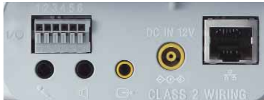
SNC-P5 Rear Panel

The SNC-P5 can output an analog composite video signal via the BNC connector. This feature is ideal for sending signals to a local recording device or monitor.