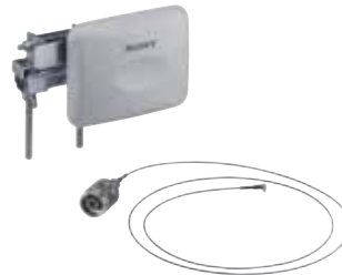
SNCA-AN1 Wireless LAN Antenna (Optional accessory for the SNCA-CFW1 Wireless card)